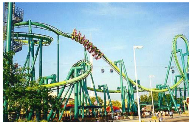
Cedar Point Amusement Park

Cleveland is located on the coast of Lake Erie. This “Great Lake” offers numerous attractions, aquatic sports, and leisure activities, including power boating, fishing, the Lake Erie Islands, and jet skiing among others. A small city with big city amenities, there is always something to do and places to be seen. At OTC you are 20 minutes away from the country and just minutes from downtown. When you choose OTC you get a quality education in a city that truly lives up to its image.