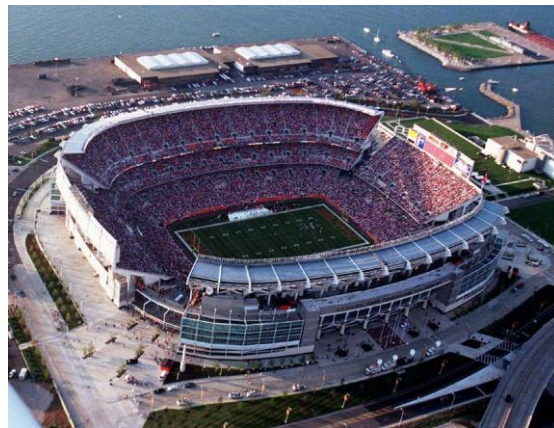
The First Energy Stadium, Home of the Cleveland Browns

Leading education and cultural centers, internationally acclaimed health institutions, world class sports and entertainment facilities combine with the rich tradition and unique ethnic flavor that has people all over the world noticing what Clevelanders have always said “Cleveland Rocks!”