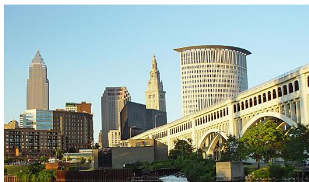
Cleveland is a great place to be!

The Greater Cleveland area boasts such attractions as the Rock and Roll Hall of Fame, Great Lakes Science Center, Playhouse Square Theater District, Gateway Sports Entertainment complex (includes Progressive Field and Quicken Loans Arena), Pro Football Hall of Fame, Cedar Point Amusement Park, Mid-Ohio Race Track, and the Flats Entertainment District as well as the Warehouse district for fine restaurants and night life. Cleveland is also the home of the Cleveland Guardians, Cleveland Cavaliers, Cleveland Browns, Cleveland Gladiators, and the nation’s third largest New Car Auto Show.