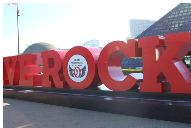
OTC Rocks Cleveland at a sponsored event at the Rock and Roll Hall of Fame

The Greater Cleveland area boasts such attractions as the Rock and Roll Hall of Fame, Great Lakes Science Center, Playhouse Square Theater District, Gateway Sports Entertainment complex (includes Progressive Field and Quicken Loans Arena), Pro Football Hall of Fame, Cedar Point Amusement Park, Mid-Ohio Race Track, and the Flats Entertainment District as well as the Warehouse district for fine restaurants and night life. Cleveland is also the home of the Cleveland Guardians, Cleveland Cavaliers, Cleveland Browns, Cleveland Gladiators, and the nation’s third largest New Car Auto Show.