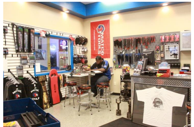
The student will have the option to purchase additional tools at up to 52% off retail from the college.

All tools required for the completion of training are purchased by students during their first quarter of attendance. These tools satisfy the requirements of many employers who request that newly employed technicians supply their own basic tools. For students interested in additional tools, OTC has established a special discount tool-purchasing program for students through the school's on campus MATCO Tool store.