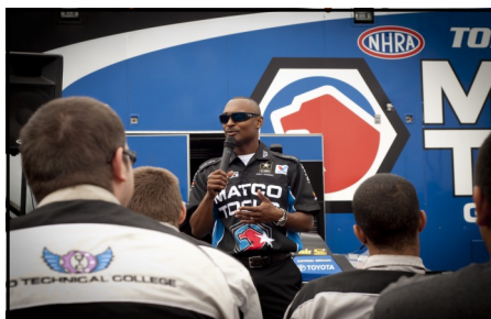
Pro drag racer Antron Brown speaks to OTC students for his fourth year.

It's not everyday that students get an up close look at a real NHRA Drag Race Car, or the person who actually drives it! Antron Brown made at stop at OTC to visit with our students before competing in the NHRA Nationals at Summit Raceway Park June 25th. "This is my fourth year visiting OTC," says Antron. "I love