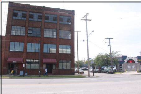
This 4 story brick building known as The City Desk. It will be the new home of custom paint & graphics and engines.