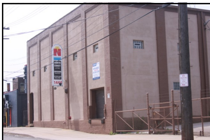
North Coast Litho will be the new home for classic car restoration.

Over the past two years, OTC has been expanding at a faster than normal rate. "We have purchased four buildings adjacent to our main facility in the past twenty-four months," Tom King, Director of Training said. "We are currently in the process of expanding custom paint and graphics as well as our engines and transmissions lab. Classic car restoration has grown faster than anticipated, and they need more space." The North Coast Litho building on 49th Street is the most recent acquisition, and will be the new building for classic car restoration. The classic car restoration program is just five years old, and has seen the biggest increase in enrollment. One big goal for this program is not to have a waiting list for students who want into the program. "As soon as we get the keys, I will have crews in there getting it ready," assured King. "With nineteen cars undergoing restoration, and more students wanting into that program, we need more space to operate it efficiently. The Edelbrock Academy also needs space, so some programs are moving to different labs to accommodate their specific needs. The new Edelbrock Academy is slated to begin accepting students in late fall 2011. OTC's staff is also growing and currently there isn't room in our main facility for new hires to have an office. We are beyond the breaking point and need office as well as classroom space for future staff and students.