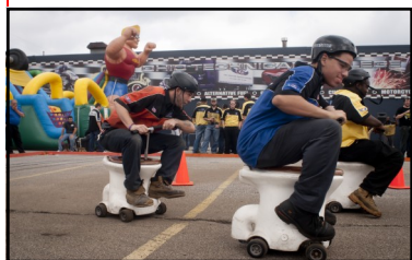
OTC students race toilets and have fun during Matco Motorsports Day.