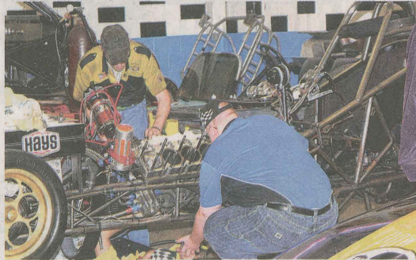
Students from Ohio Technical College are at work on high performance vehicles.

"We realized that a campus expansion was essential to the growth of the college. It allows us to continue to offer our students the adequate working space that they are